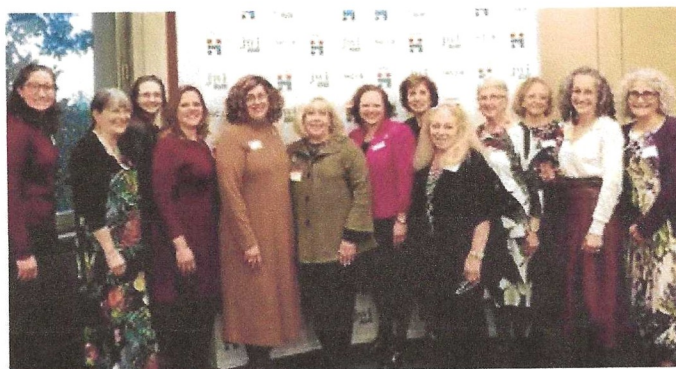
2025 Day on the Hill