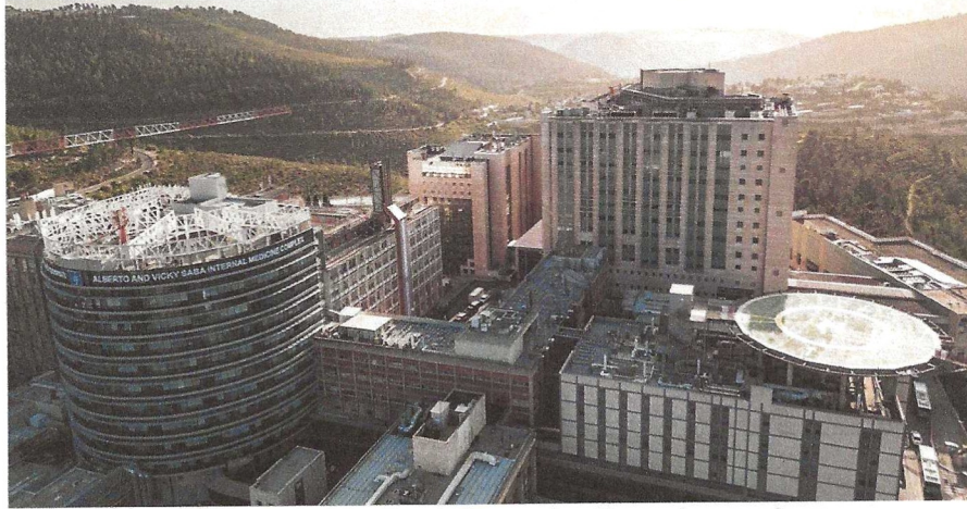
Hadassah Medical Organization, Jerusalem

Jerusalem — The leading journal Nature has named the Hadassah Medical Organization , the hospital system of Hadassah, The Women's Zionist Organization of America, the #1 hospital in Israel for scientific output . The publication's Nature Index also ranks Hadassah among the top 200 hospitals worldwide.